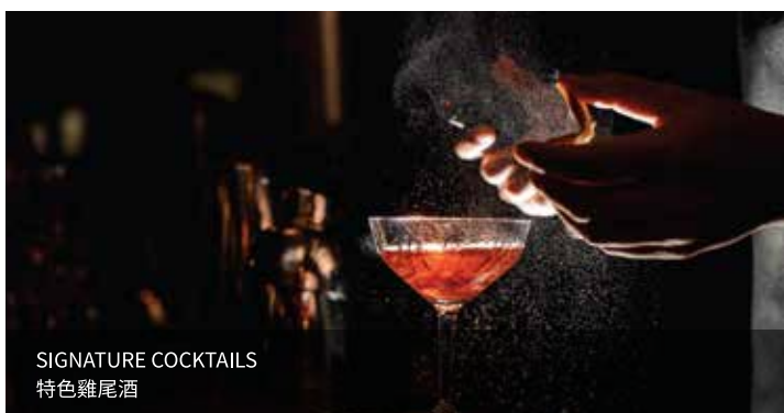
SIGNATURE COCKTAILS 特色雞尾酒