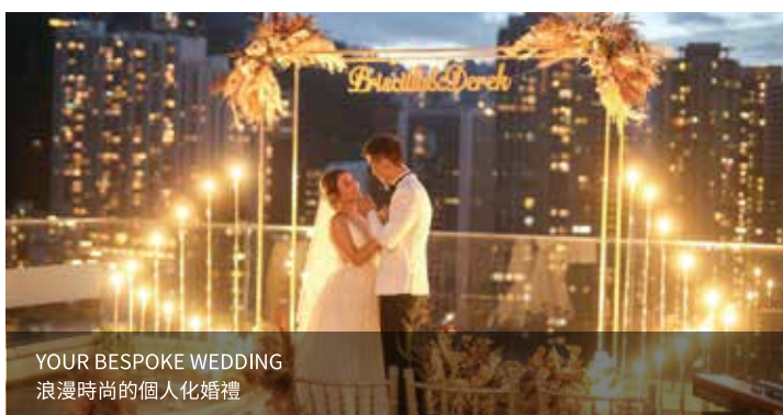
YOUR BESPOKE WEDDING 浪漫時尚的個人化婚禮