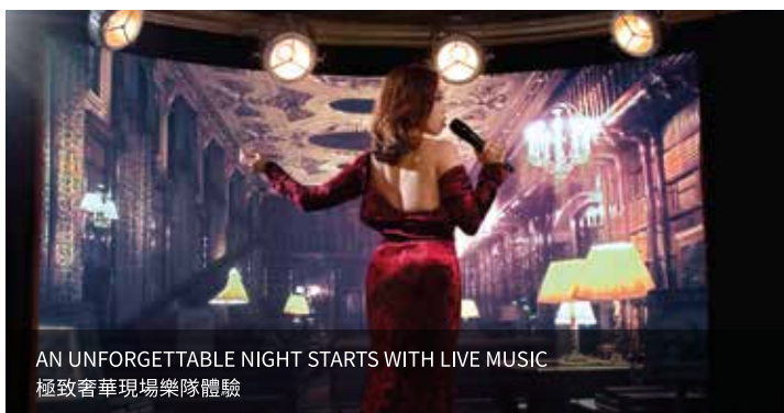
AN UNFORGETTABLE NIGHT STARTS WITH LIVE MUSIC 極致奢華現場樂隊體驗